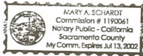
Signature of Notary Public